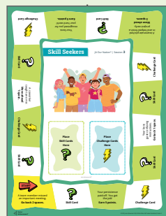
Skill Seekers Game Board