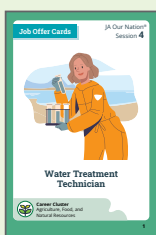
Job Offer Card