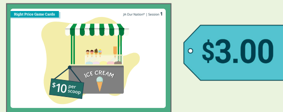
Right Price Scenario Cards and Price Tags