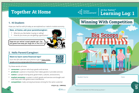
Together at Home